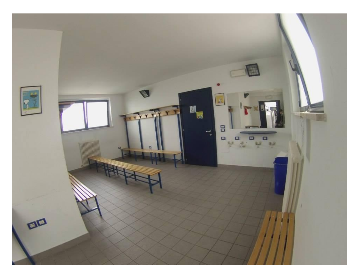
Chance room PALASNOOPY