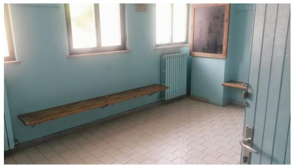
chance room Palasport