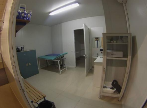
Chance room and Medical + doping control room PALACAMPANARA